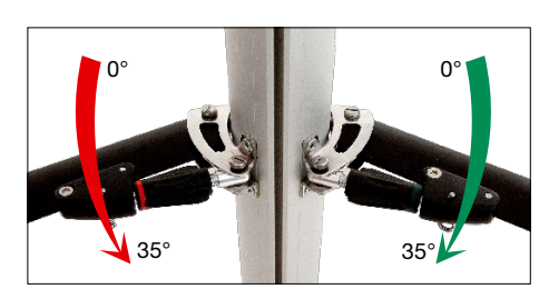
All brackets are formed on a precision jig. With no welding processes, every bracket is perfectly symmetrical and consistent.

Both systems have a dihedral angle locked into the bracket to give optimum rig support, and as both brackets are shaped and fitted to the mast with precision jigs, every bracket is perfectly symmetrical and consistent.