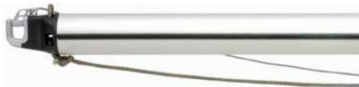
Medium composite end fitting with stainless chafe guard, trip trigger and Dyneema bridle for downhaul.

The aluminium extrusions are fitted with pole savers to shield the pole against damage from forestay and shrouds.