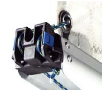
Outboard end Lines can be locked via two pegs on the side of the fitting or via a V-groove underneath the starboard sheave.