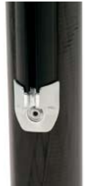
Custom PVC track.

The track has a large bonding surface for attachment to the mast. This helps to increase its strength and durability.