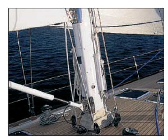
Seldén Hydraulic Built-In. All the hydraulic components are inside the mast.