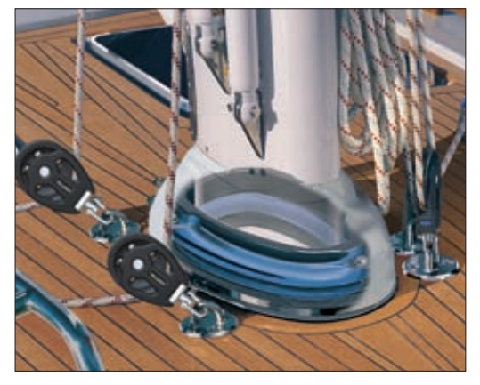
The passage of the mast through the deck is sealed by a sturdy O-ring, squeezed vertically between two deck rings. The lower ring is permanently bolted to the deck and is easy to fit. When in place, it allows sufficient mast movement in all directions.