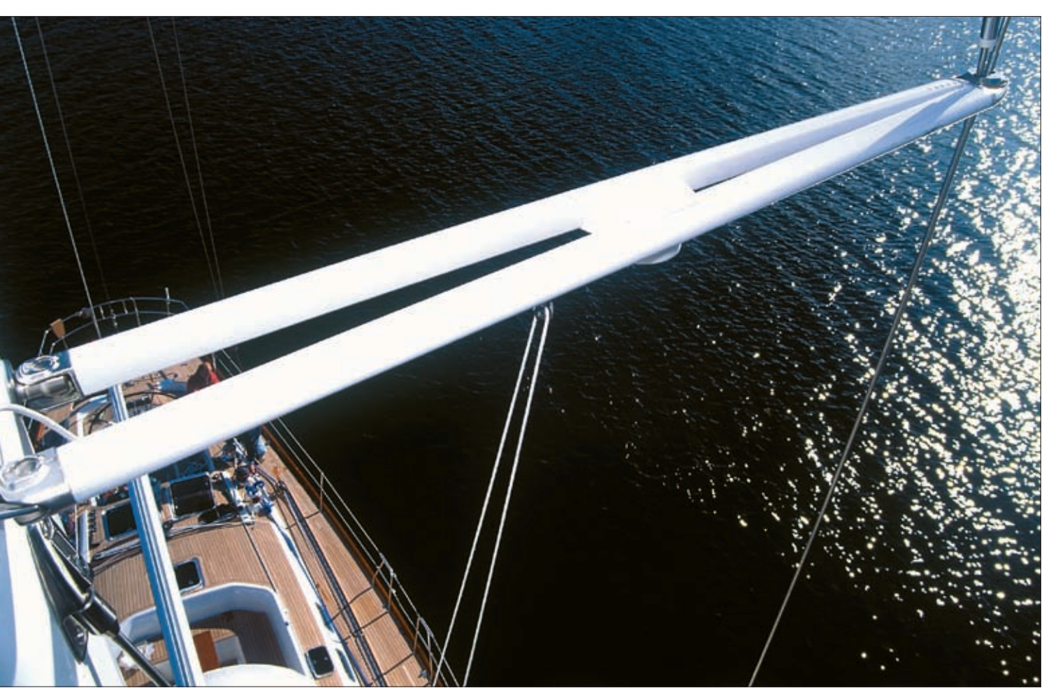
32-metre tall furling mast for 70-fot yacht.

The V-spreaders are a vital part of Seldén's eye-appealing design concept for yachts of around 40 feet and upwards. We believe that whatever looks well on board should also work well on board, and vice versa. The V-spreader is a typical example of the kind of functional design that is characteristic of all Seldén masts.