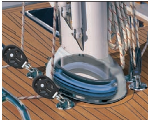
The passage of the mast through the deck is sealed by a sturdy O-ring, squeezed vertically between two deck rings. The lower ring is permanently bolted to the deck and is easy to fit. When in place, it allows sufficient mast movement in all directions.