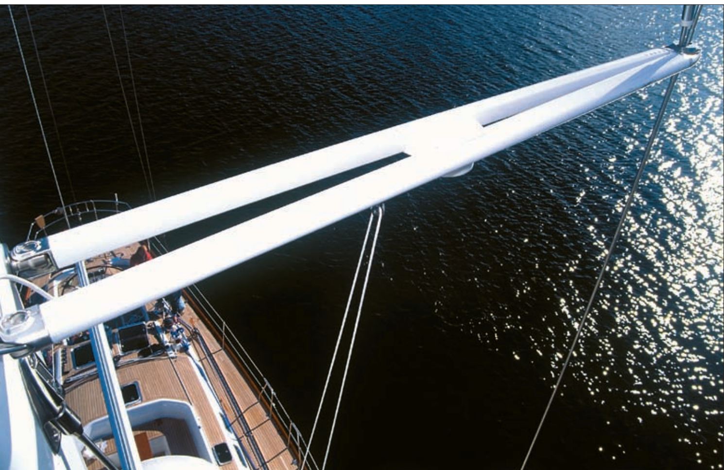
32-metre tall furling mast for 70-foot yacht.

The V-spreaders are a vital part of Seldén's eye-appealing design concept for yachts of around 40 feet and upwards. We believe that whatever looks well on board should also work well on board, and vice versa. The V-spreader is a typical example of the kind of functional design that is characteristic of all Seldén masts.