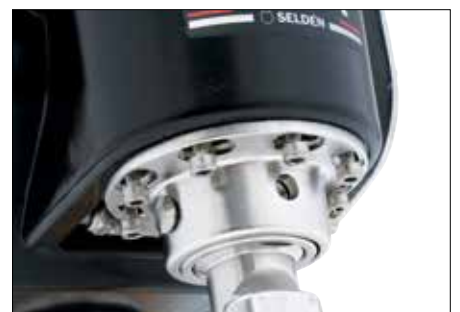
Adjustment screws enable the Furlex housing to be aligned precisely.