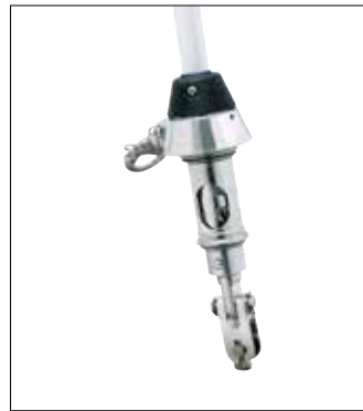
Ready to get powered up.