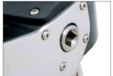
In case of power failure, Furlex Electric can be operated manually.