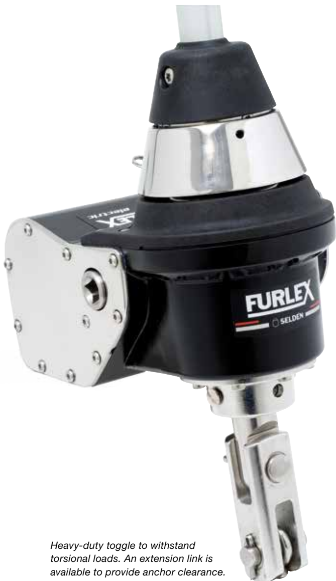
Heavy-duty toggle to withstand torsional loads. An extension link is available to provide anchor clearance.