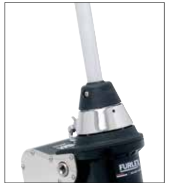
Slide on Furlex 200E from below and install the cables. Done!