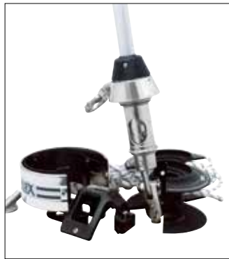
Remove line guard, line guide, rope and drum halves.