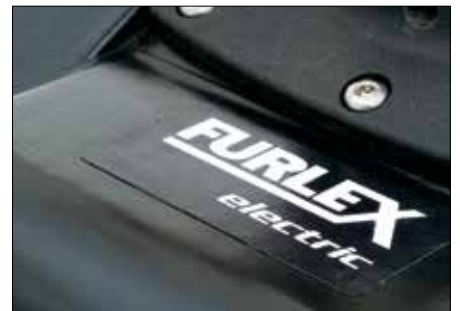
Manufactured from high-grade materials for rugged reliability and long service life.