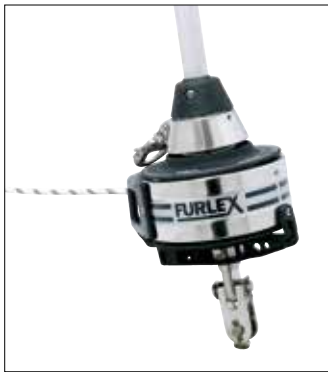
Manual Furlex 200S.

Push-button performance is an easy upgrade for anyone who already has a manual Furlex 200S, 300S or 400S series on their yacht. The furling line, drum and line guard assembly are simply replaced with a Furlex Electric motor unit. No sail conversion is required as the luff length of your existing sail is unaffected.