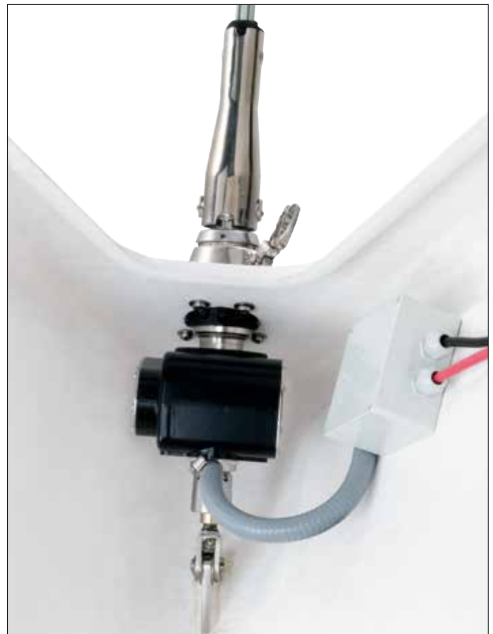
Installation of a Furlex 200TDE. The connection box is water-tight.

Furlex Electric is available for either on-deck or through-deck installations. The main advantage of a through-deck installation is better sailing performance as a result of maximised luff length. More space on the foredeck is an added bonus!