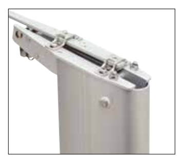
The backstay flicker comes complete with fasteners and back-stay block.

The backstay flicker is a glass fibre rod fitted to the head box on a fractional rig with swept spreaders. It lifts up a wire or rope backstay to allow for free passage of a full roach mainsail.