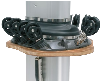
Deck ring with moulded mast coat.

Tie rods with four fixed settings – plenty of leeway for adjustment.