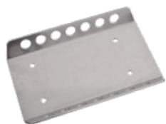
Stainless rail, Art. No. 508-728 and 508-179