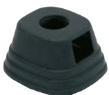
Block stand-up, rubber. Art. No. small 319-512 (PBB50) Art. No. medium 319-669 (PBB60/70) Art. No. large 319-680 (PBB80)