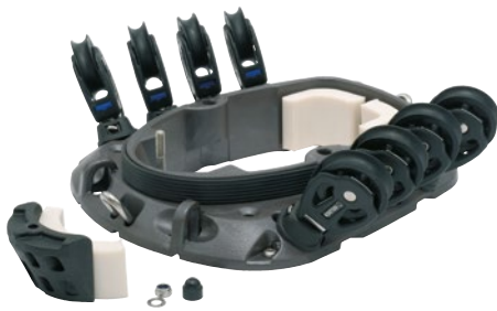
Remove the wedge.

The underside of the heel plug is convex, in order to allow rake without subjecting the mast section to point loading.