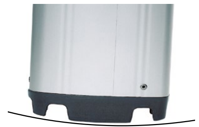
Convex underside of heel plug – distributes compression load evenly on the mast section.