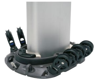
Secure the mast by tightening the nut on the wedge.